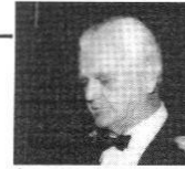
Gen. Westmoreland will be our honored guest.