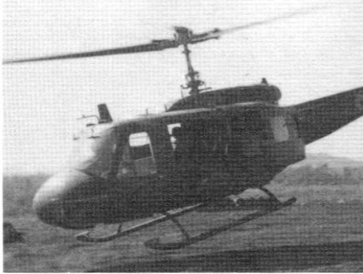
Going on a mission — Dak To '67