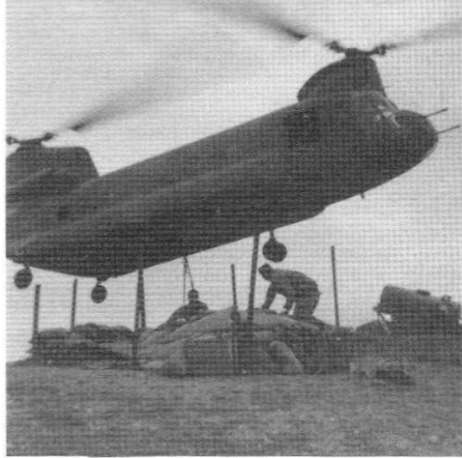
Rule #3 — Never put your hooch next to an LZ.