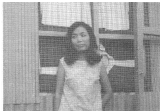
An Khe "Hostess".