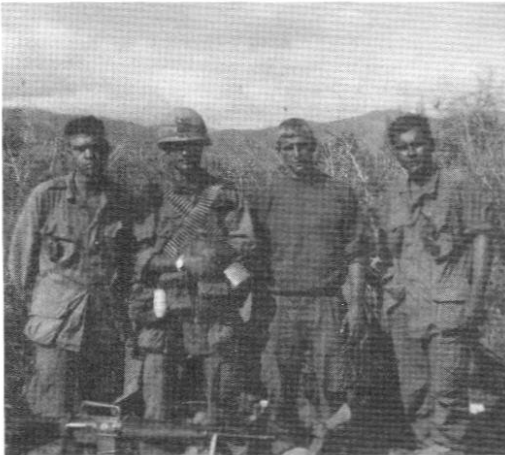
How come I have to carry everything? 'Cos we're short!!