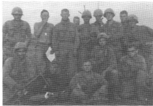
"The Dirty Dozen" — looking for "Charlie". 3rd Plt '68