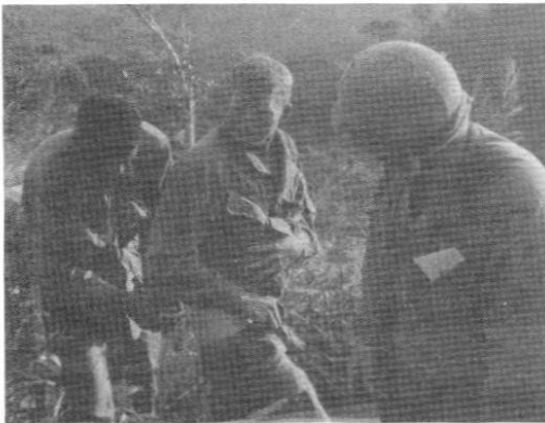
Penicilin? Hey Doc, I only went to the vil once!