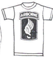
T-SHIRTS — $7.00 each