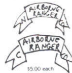
$5.00 each Color Only