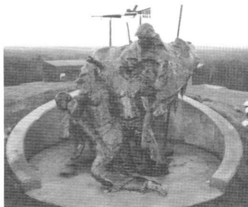
The "Highground" — A Memorial to People.