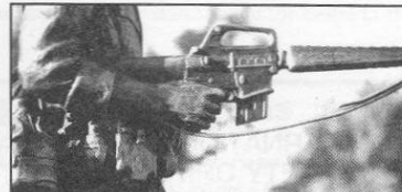
Note tremendous detail of weapon and equipment