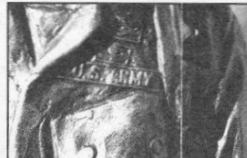
CIB jump wings tiny but clearly visible

Satisfaction Guaranteed Issued Numerically