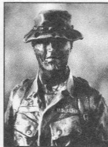
Optional Bush Hat