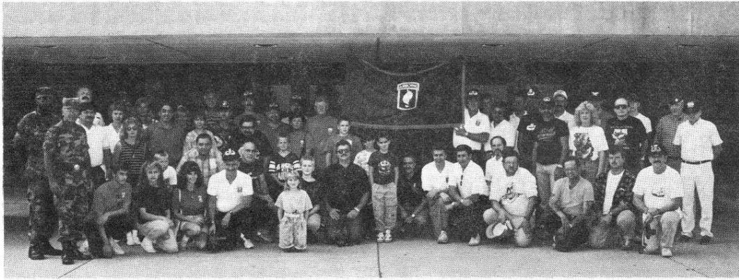
Chapter members from New York (Chapter II) and Philadelphia (Chapter IV) at the October 1990 Open House at Ft. Dix, NJ.