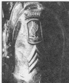
Unit patch and optional Rank

Satisfaction Guaranteed Issued Numerically