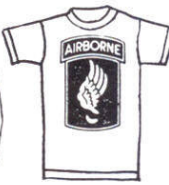
T-SHIRTS — $7.00 each