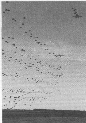
Paratroopers returning home to Ft. Bragg, N.C. in the proper manner.

The FIST teams from B/3-319th led the way when 2-504 Inf conducted a combat air assault into the Panama Defense Force (PDF) installation at Panama Viejo. The 2-504 Inf quickly overwhelmed resistance offered by the PDF Cavalry Squadron and elite U.E.S.A.T. (counter-terrorist unit), and secured the old fortress ruins. Launching operations from