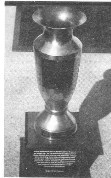
The 105mm Shell Memorial from Hill 875.