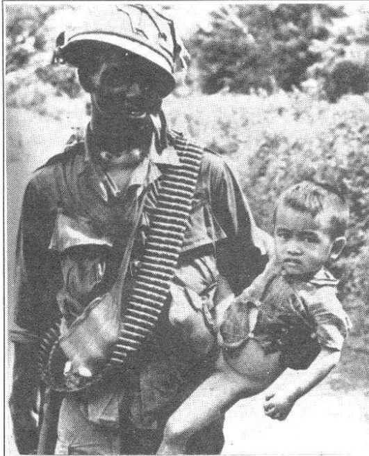
Who is this Sky Soldier? And where is he now?