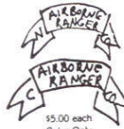
$5.00 each Color Only