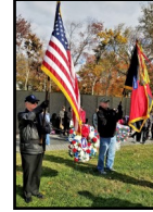
Flags at Parade