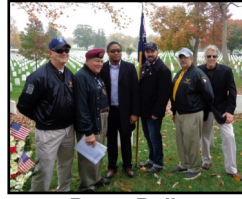
Bravo Bulls Past and Present