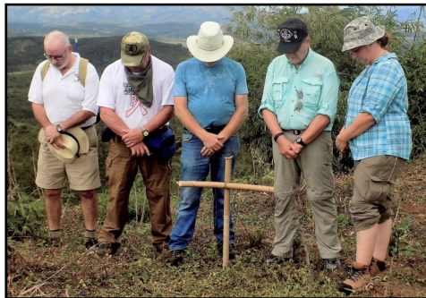
Fiftieth Anniversary Memorial Service on Hill 823