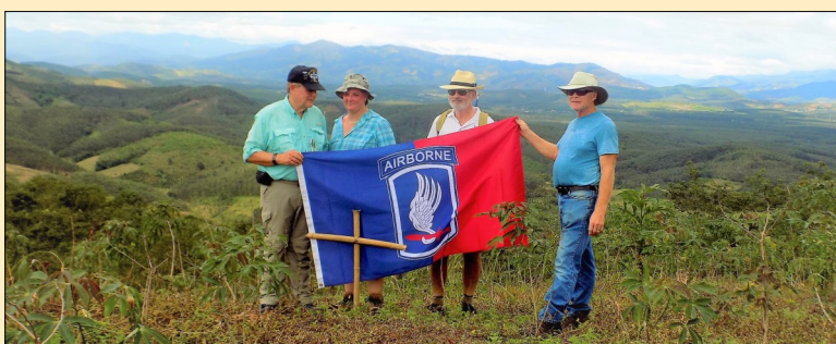
The 173 d Airborne Brigade Reoccupies Hill 823

Back in 1968, the prison was a key NVA objective because he held over 600 NVA and VC POW's.