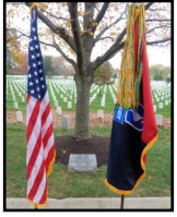
Flags flanking Brigade Marker