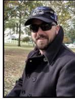
GWOT Sky Soldier