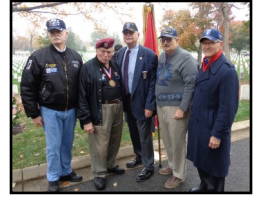
Past Chapter 1 Presidents