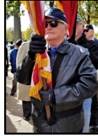
Cherishing the Flag