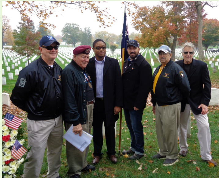
Battle Company 2/503d Combat Veterans