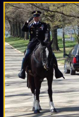
A Mounted Salute