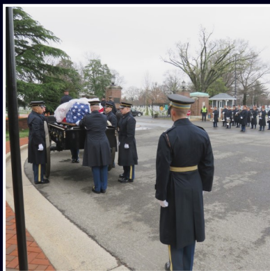
Old Guard Placing the Casket on the Caisson