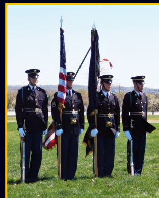
Old Guard 3 d Infantry Regiment