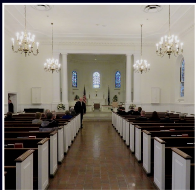
Old Post Chapel Fort Myer, VA