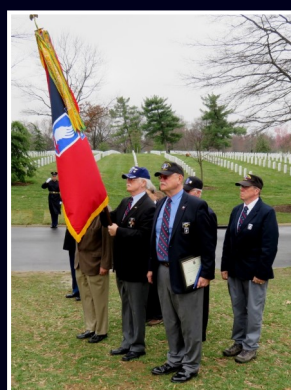
Chapter 1 Honor Guard Detail