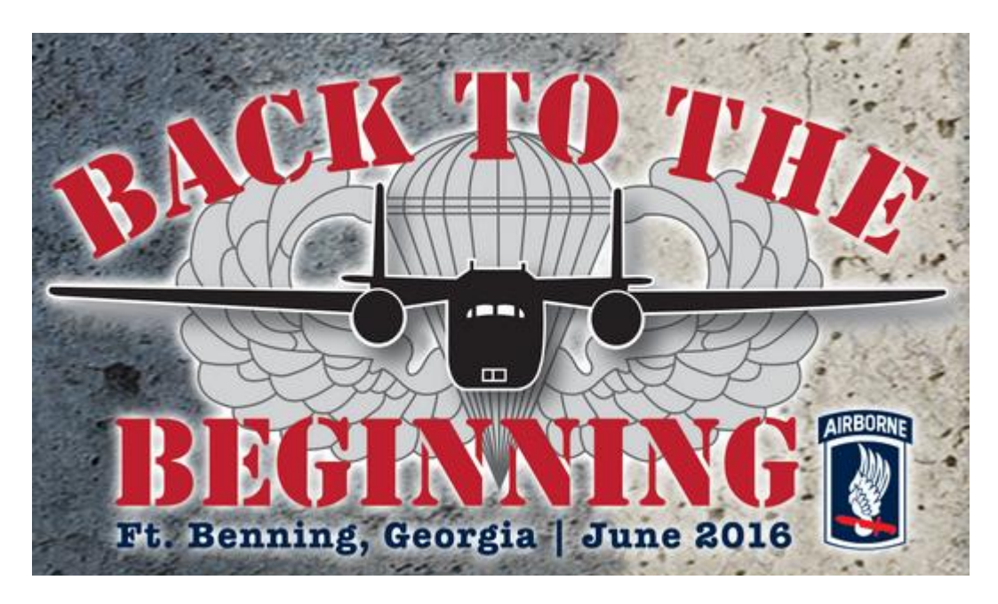
Don't forget the reunion next year at Ft. Benning!!

Link is: <a href="http://www.173dreunion2016.com/">http://www.173dreunion2016.com/</a>