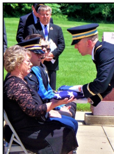
... from a Grateful Nation