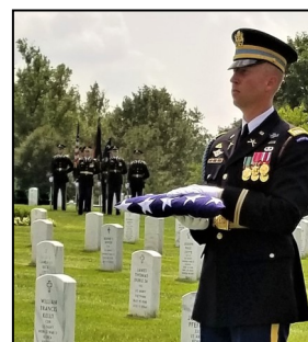
Memento of Service