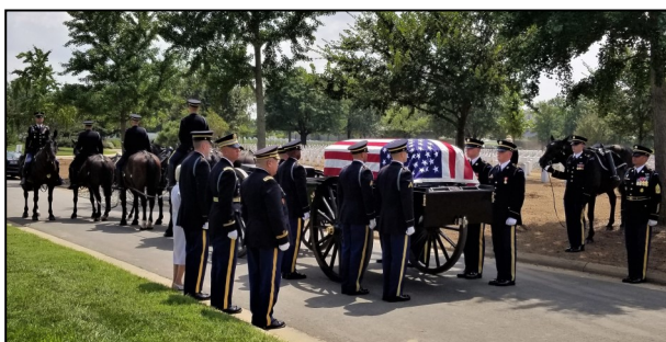
With Dignity Due