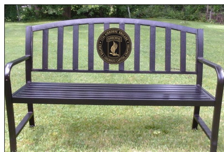
Prospective Herd Park Bench