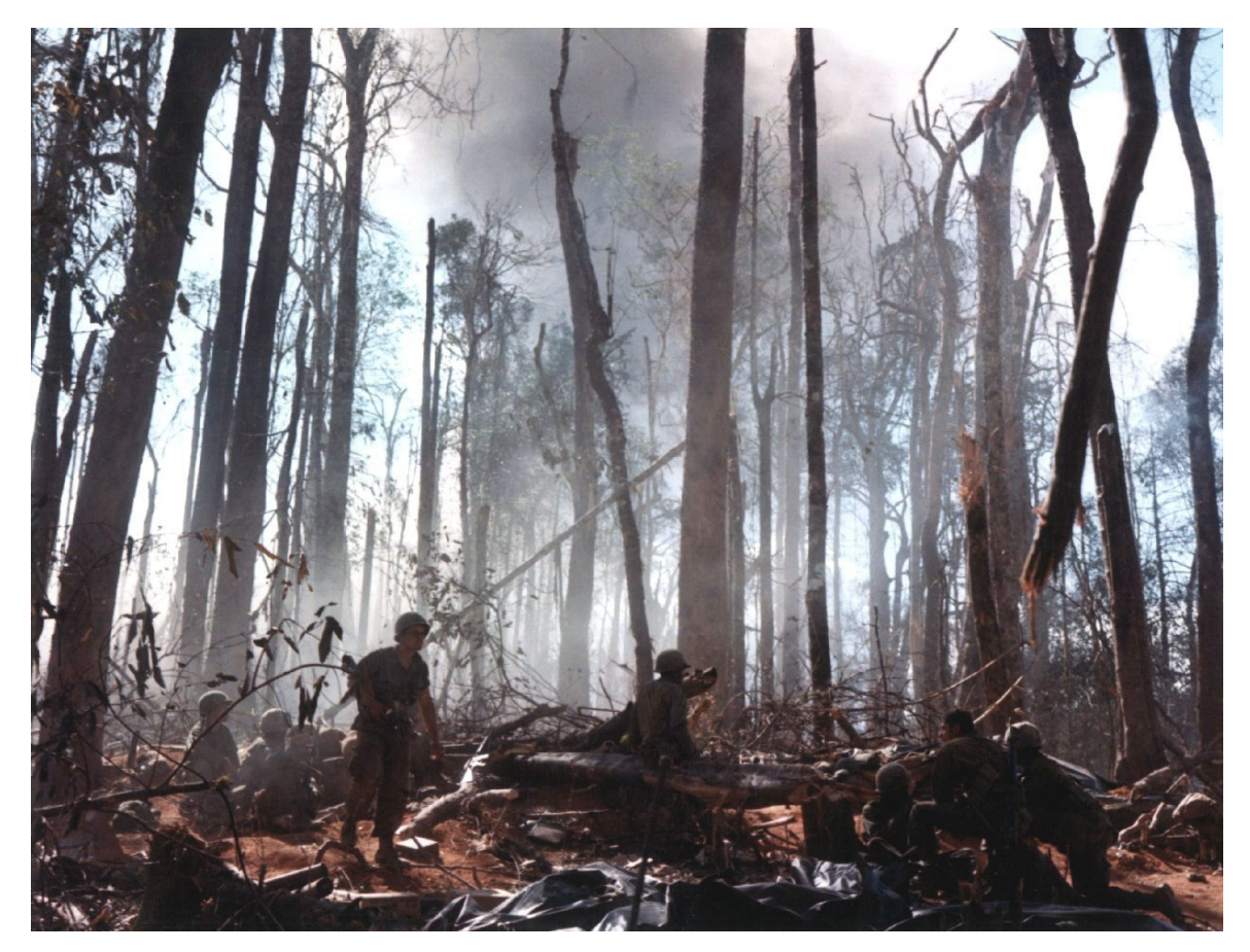
Hill 875- Battle of Dak To Vietnam November 1967