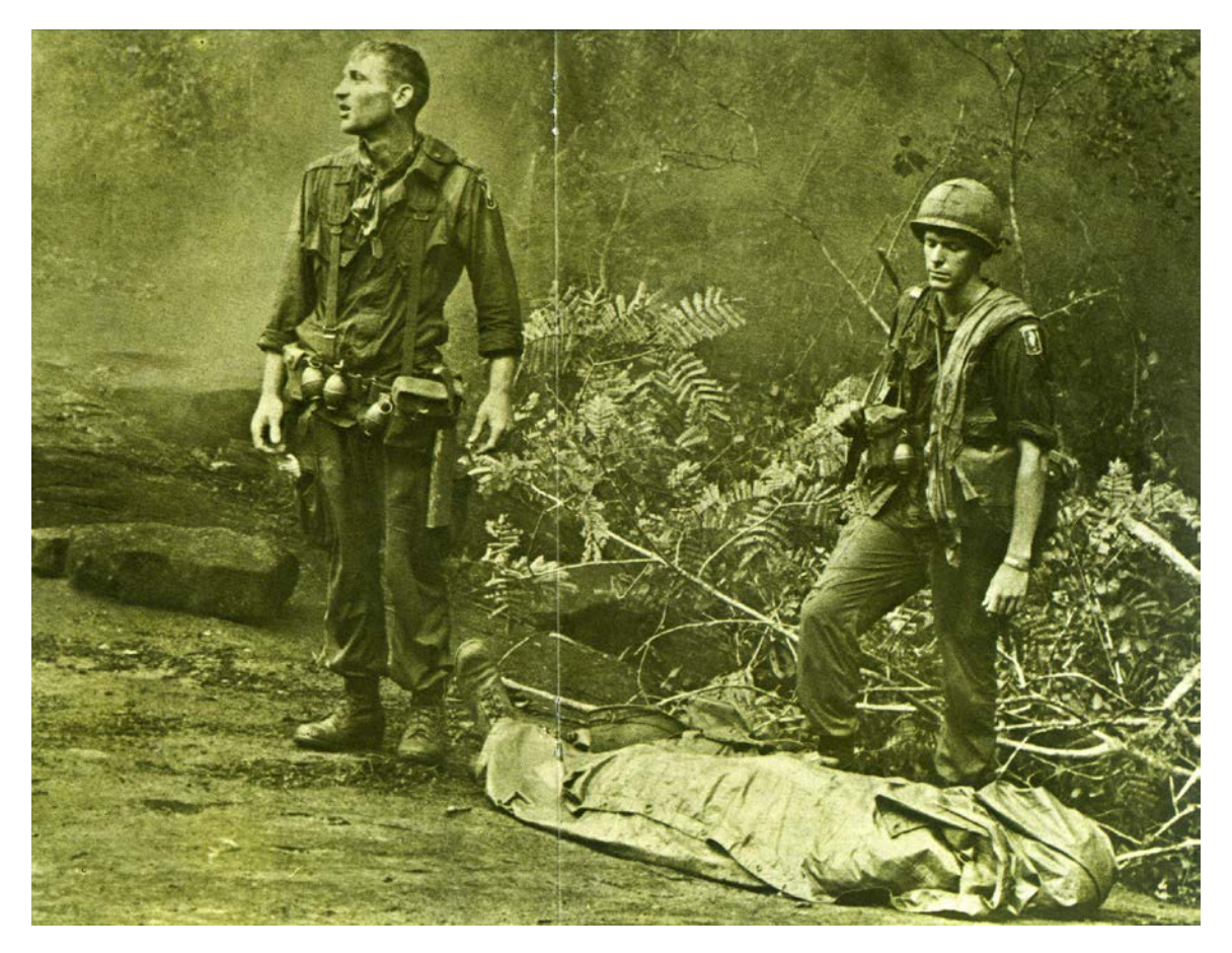
"Agony of War"